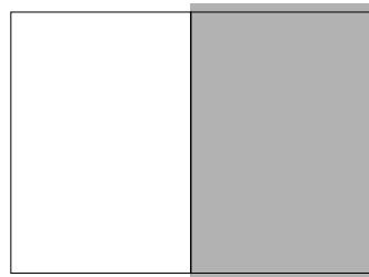
Full page advert